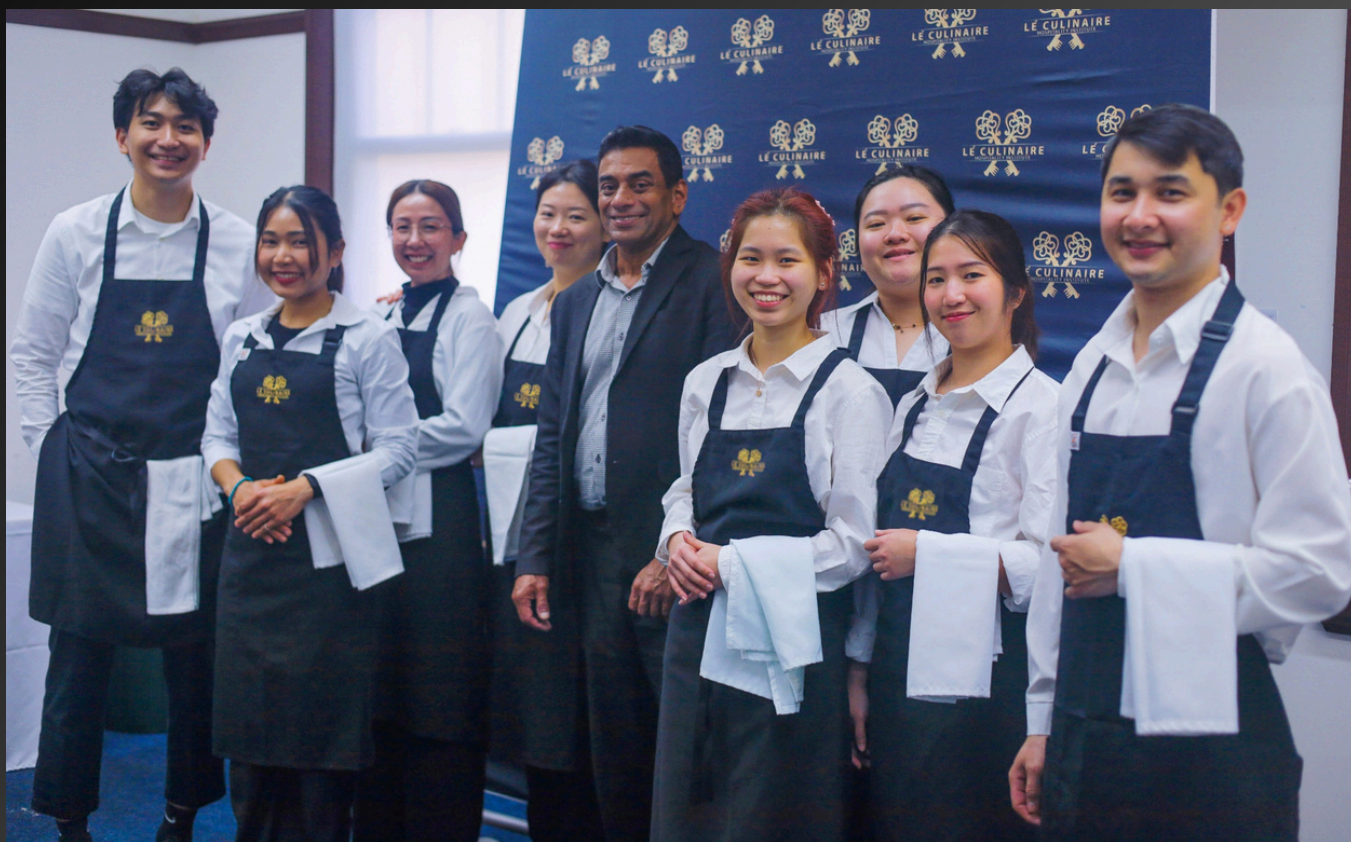
EXAMPLE PATHWAY TO A QUALITY CAREER